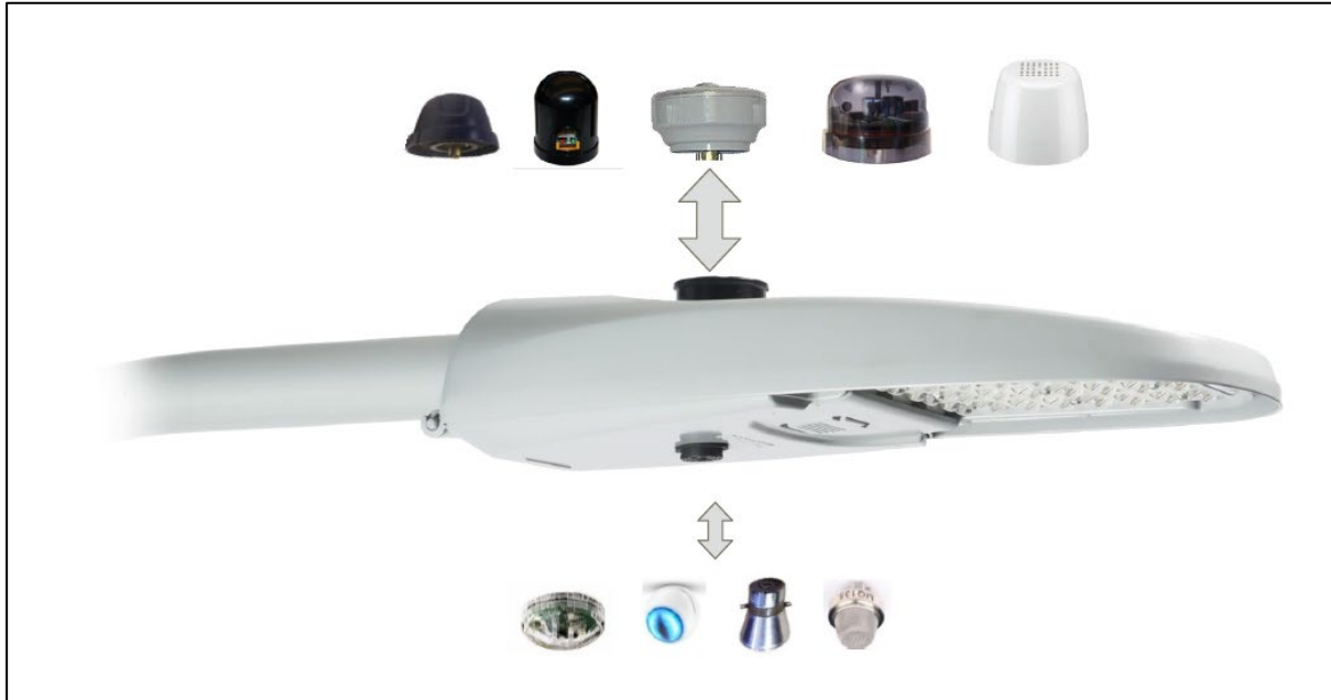
FIGURE 3: LUMINAIRE WITH SMART CONTROLS ON TOP AND SENSORS BELOW

sensors, while generally only 1-3W, is variable. Such luminaires are already being deployed in Australia by both DNSPs and councils.